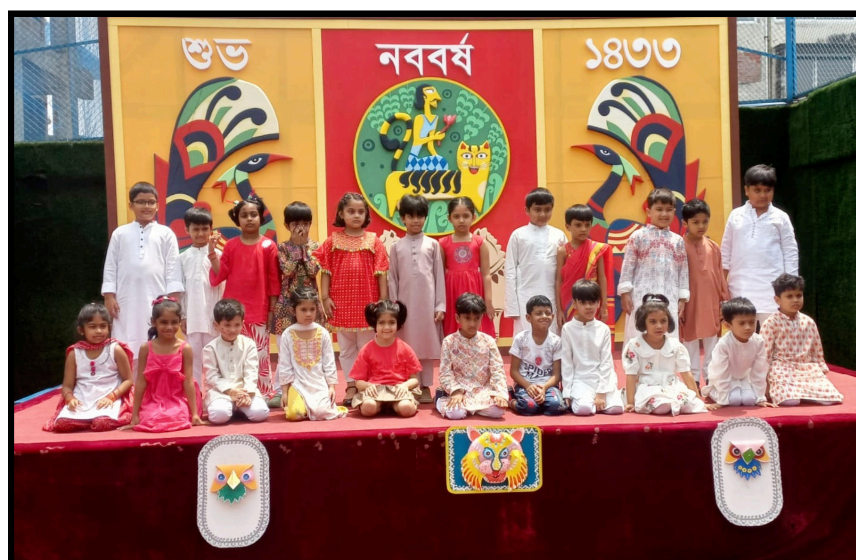
Students celebrated the Bengali New Year in red and white attire, enjoying activities with teachers and peers at school.

Our students returned to school happily after celebrating Eid with their families, bringing excitement and energy back to the campus. To continue the festive spirit, we celebrated Pohela Boishakh with great joy. Students came dressed in beautiful red-and-white traditional outfits and took part in music, dance, art, and lively performances with their friends and teachers. It was a meaningful and joyful way to welcome the Bengali New Year together. A class group photograph was taken to commemorate this academic session.