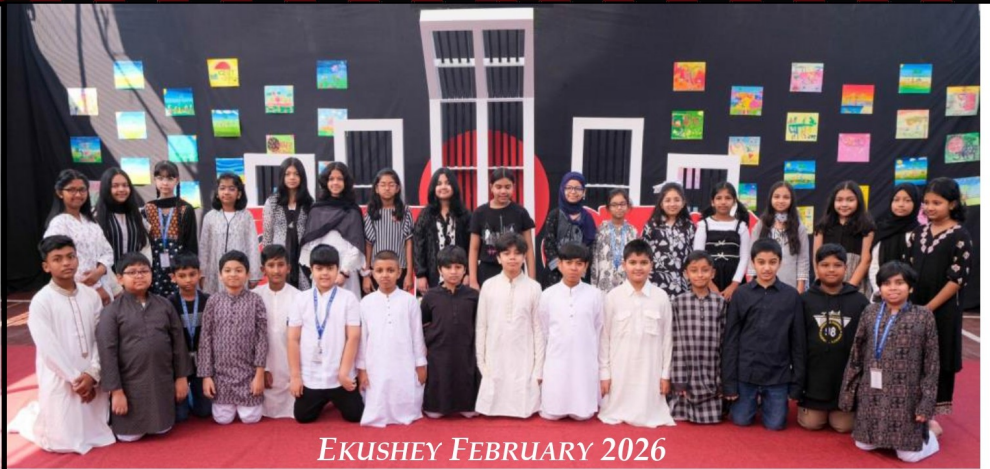
EKUSHEY FEBRUARY 2026